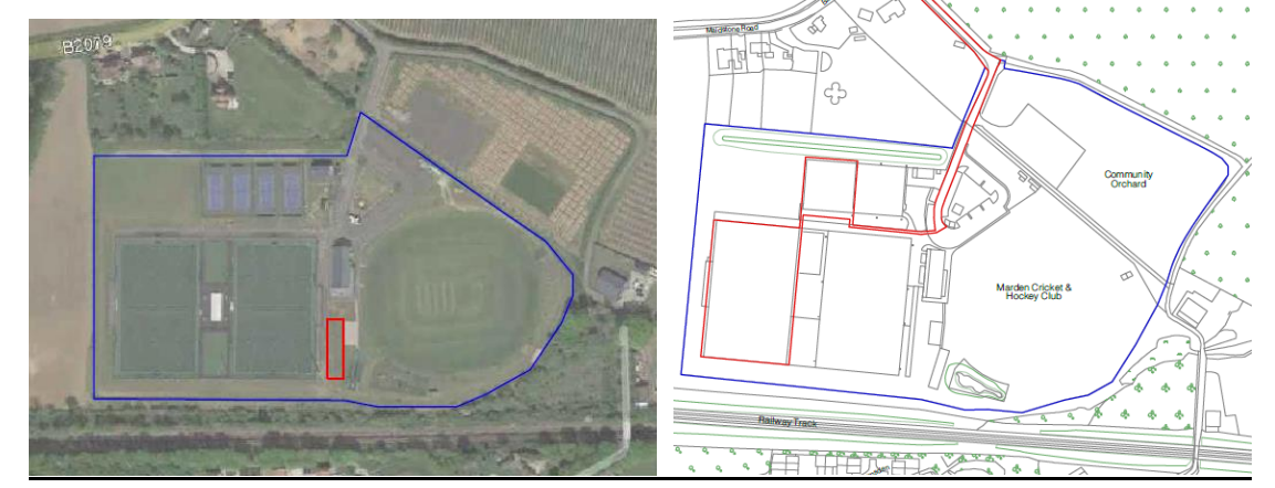
Site location plans: (left - allowed appeal site) (right - current application).